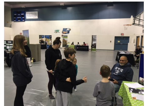
Photo taken Thursday, January 30, 2020. At the Town of Hepburn table, at Hepburn School's CAREER FAIR, visiting with Hepburn Before & After School Pro-