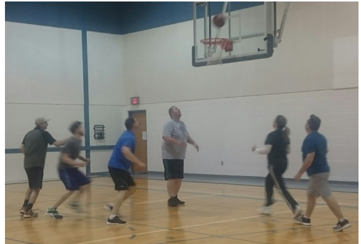
BASKETBALL CONTINUES! Pictured: Adult Bball 3 on 3 game, during Monday drop in time. NOTE: $2/drop in fee. One end of the gym is open for shooting around; and one end for game play. Join in Mondays Mar 5/12/19/26. **Free on March 19th!

Lane rentals $60/hr for lanes. Plus $25 for multipurpose room rental for food & beverage use. Call Janet at 306-947-2192 or 306-947-2073.